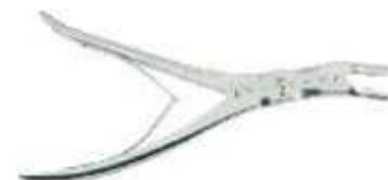
Lacksell Rounger Part No. B 502001000T