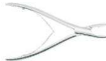
Rounger Kilner Part No. B 506001000T