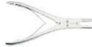
Bone Cutter Liston Single Action Part No. Straight B 524001000T Curved B 524002000T