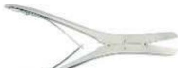
Bone Cutter Liston Double Action Part No. Straight B 525001000T Curved B 525002000T