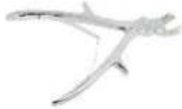
Bone Cutter Horsey Part No. B 522001000T