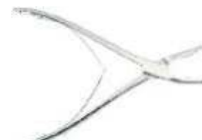
Olecrona Rounger Part No. B 505001000T