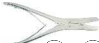
Sargent Rounger Part No. Straight B 503001000T Curved B 504001000T