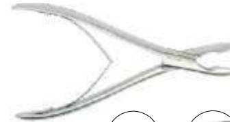
Bone Nibbler Double Action Part No. Straight B 501001000T Curved B 501002000T