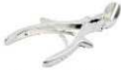
Bone Cutter Tuderd-Edward Part No. B 523001000T